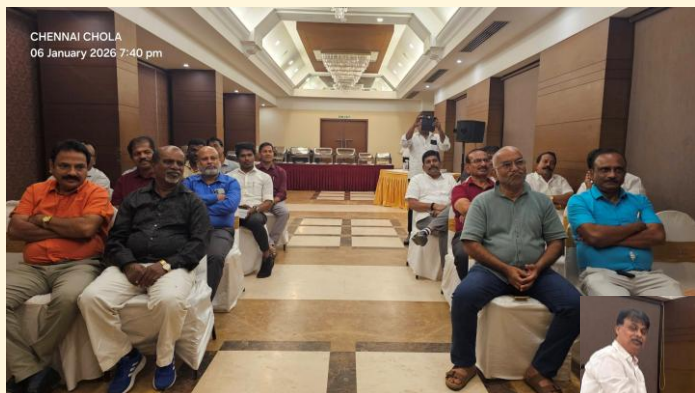
CHENNAI CHOLA 06 January 2026 7:40 pm

A group photograph was taken to mark this memorable occasion, symbolizing unity and fellowship. The evening gracefully ended with dinner and camaraderie, further strengthening the bonds among our members.