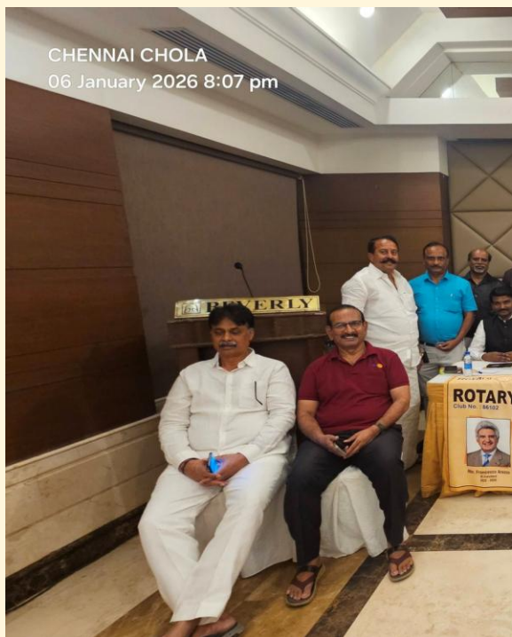
CHENNAI CHOLA 06 January 2026 8:07 pm