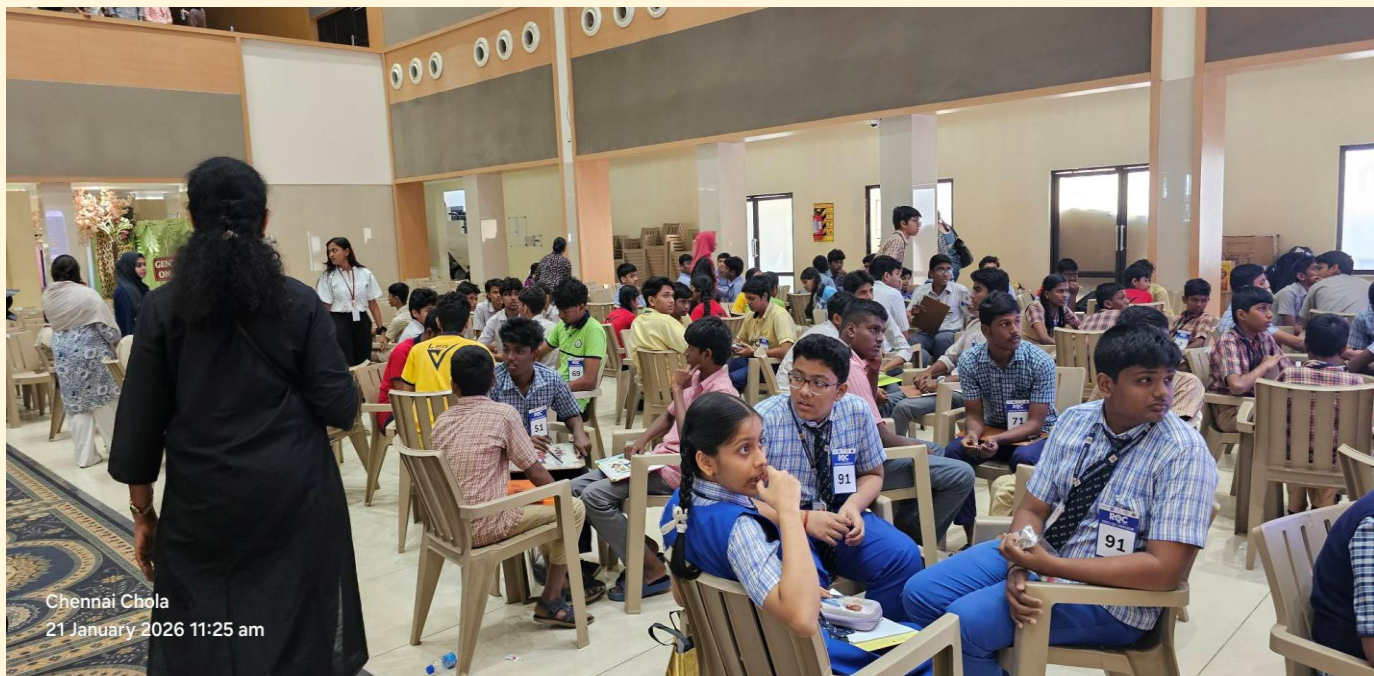
Chennai Chola 21 January 2026 11:25 am