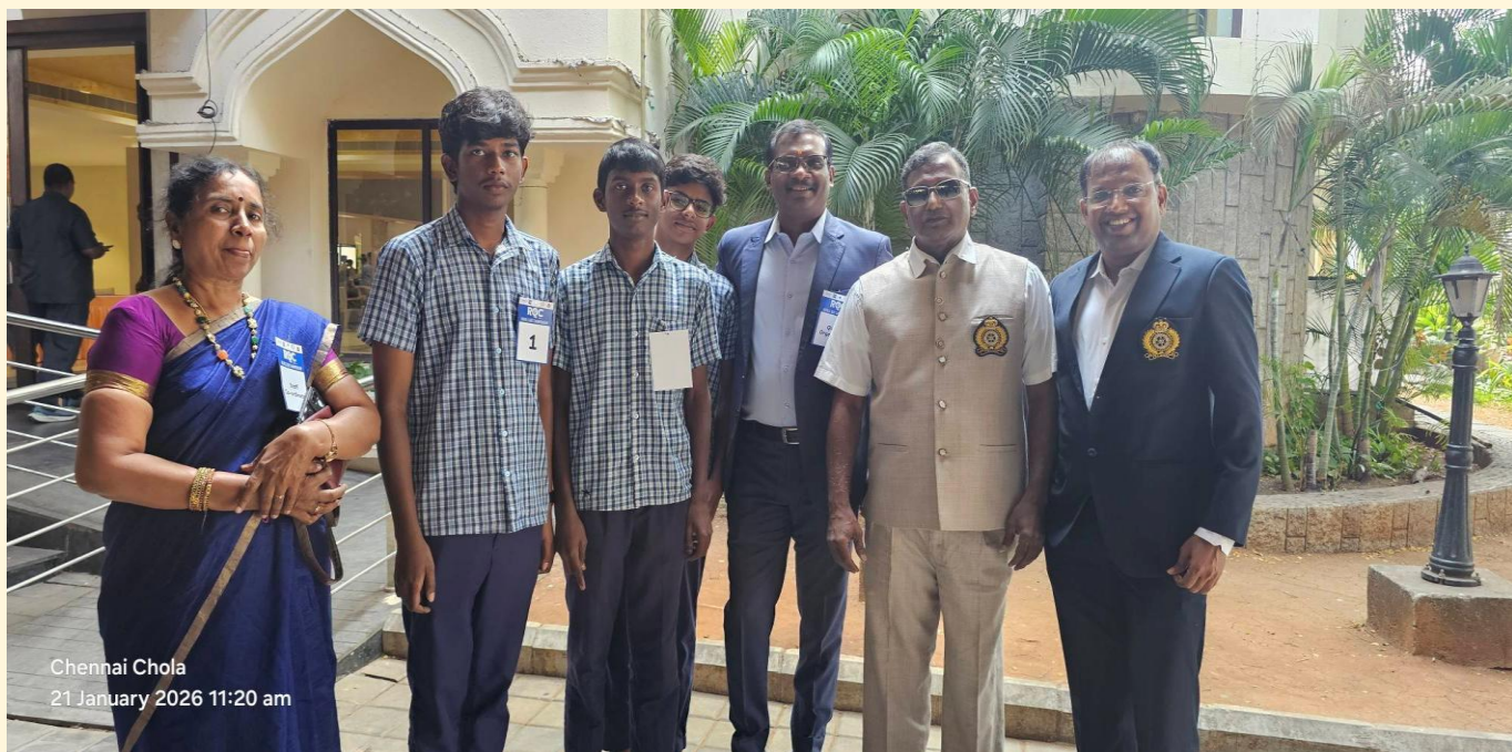
Chennai Chola 21 January 2026 11:20 am

On 21st January 2026, the Royals Quiz Championship (RQC) – Season 2 was successfully conducted by the Rotary Club of Chennai Royals at the New College Auditorium. The Interact Club students of Thandurai School actively participated in the championship. On this occasion, the President of Rotary Club of Chennai Chola extended his best wishes and encouragement to the students for their grand success..